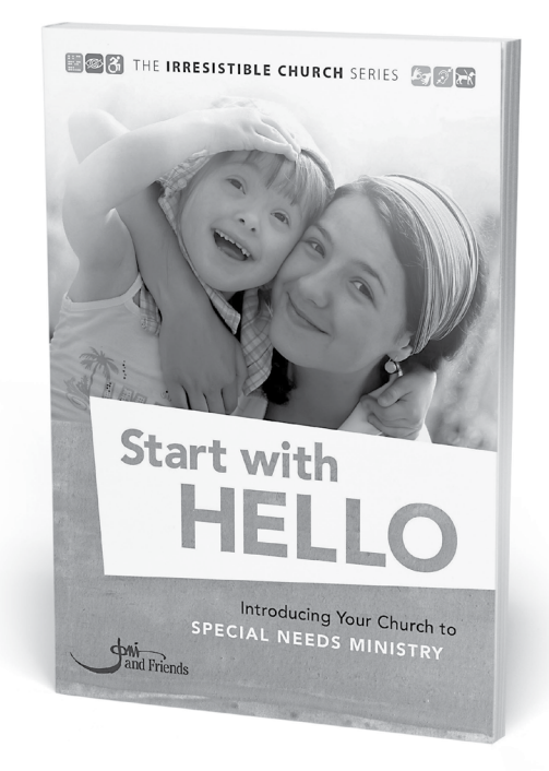
Start with Hello Introducing Your Church to Special Needs Ministry

Families with special needs often share that they desire two things in their church: accessibility and acceptance. Accessibility to existing structures, programs and people is an imperative. Acceptance with a sense of belonging by the others who also participate in the structures, programs and fellowship of the church is equally necessary. In this simple book you'll learn the five steps to becoming an accessible and accepting church.